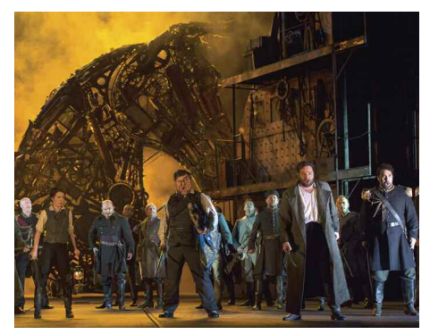
Les Troyens

At Menlo School, 50 Valparaiso Avenue, Atherton, CA. Signs will be posted to guide guests to parking and the event.