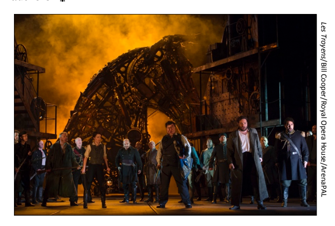
A Scene from the coming production of Berlioz's Les Troyens