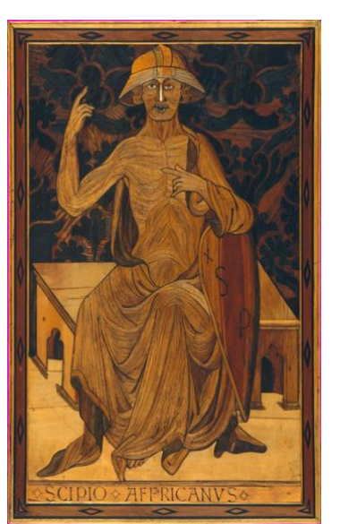
"Scipio Africanus," woodcut (1425-30 C.E.) by Mattia di Nanni di Stefano (Metropolitan Museum of Art)

These accounts of Roman interaction with conquered peoples show that the Romans were not simply merciful or ruthless. Sources 1, 3,