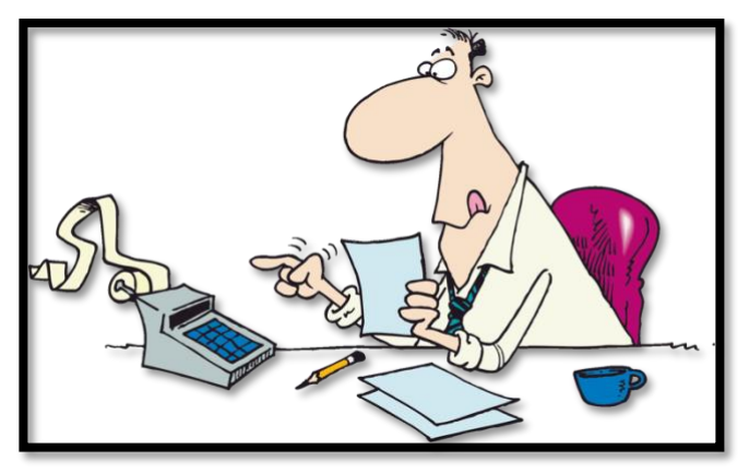
McNamara Scholarship ($250.00). Gross Outflows during the same period totaled $324.80, paid to the winner of the Student Writing Context ($250.00), and $74.80 for a 5-year extension of our ccanorth.org domain name. For this period Inflows exceeded Outflows by $500.46. *

F August 2022) the total assets of CCA- North were $11,907.18 ($1,236.69 in Wells Fargo Checking, $4,265.83 in Wells Fargo Savings, and $6,404.66 in PayPal). Gross Inflows during this period totaled $825.26 in new, renewed, and Lifetime Membership dues ($524.88), registrations for the Spring Conference ($50.14), interest gain in the Savings account ($0.24), and donations to the Marian