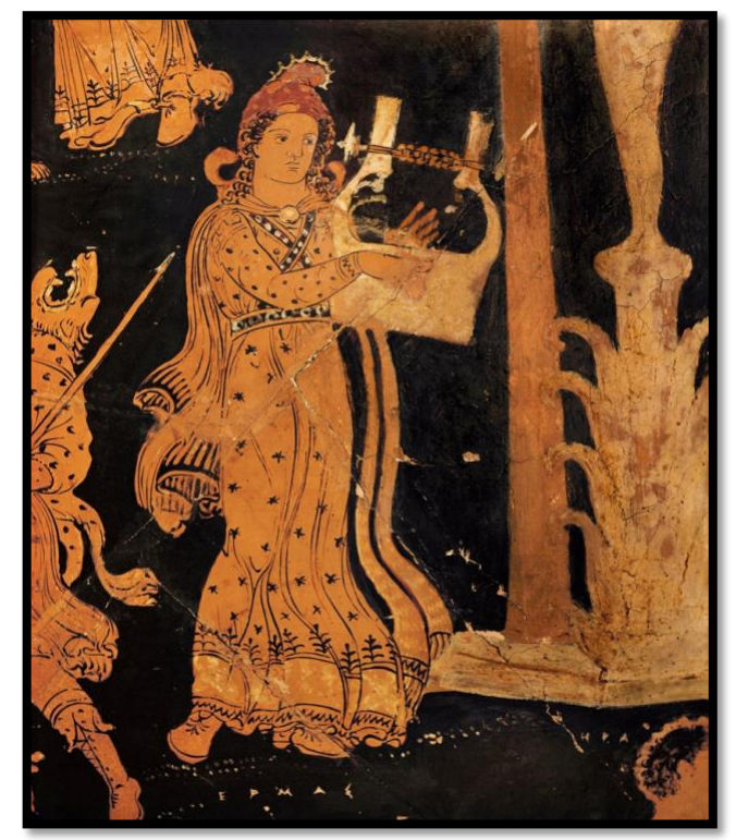
Orpheus plays the lyre for Hades .(Underworld Painter)

By October 15, go to <u>ccanorth.org</u>, where you can register and will be led to a secure site to enter payment. *