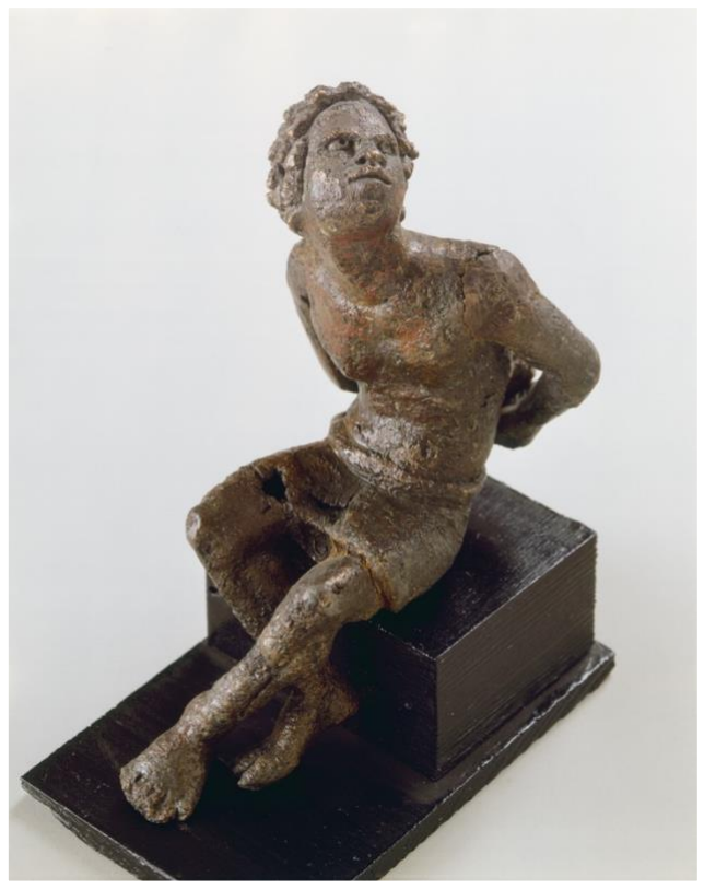
Roman bronze depiction of a captive (Staatliche Museen zu Berlin)

that the rebels were aware of the consequences, meaning that the practice of executing rebels was likely a standard practice used by the Romans. The practice of beheading was regarded as the most honorable form of death (Abbot, Encyclopedia Britannica , Beheading ). It was reserved for citizens. The fact that these mutineers were given an honorable death shows that the